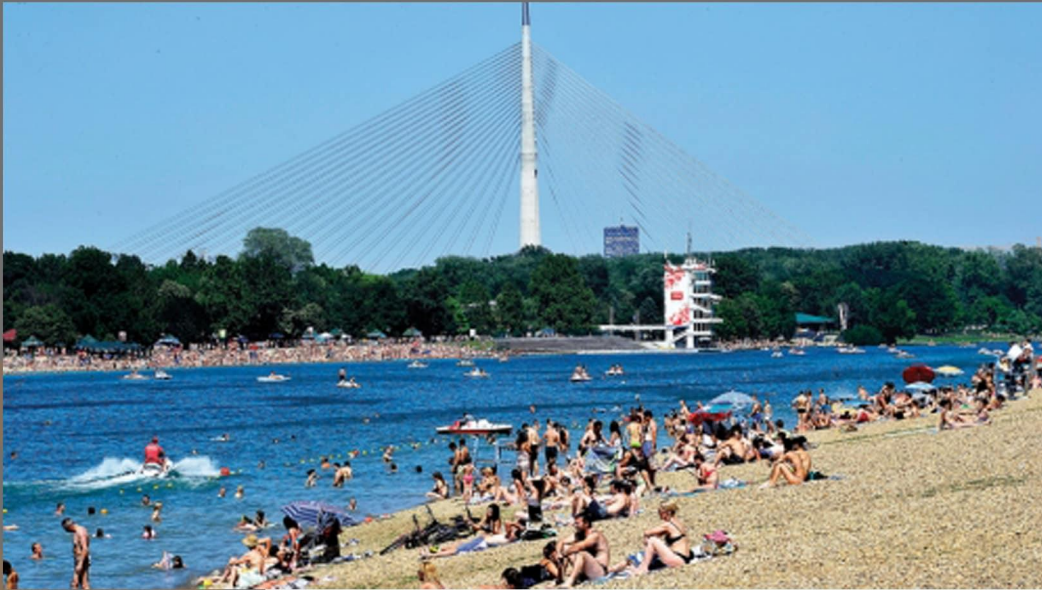
Ada Ciganlija, the sea of Belgrade

Here are some more pictures regarding our social programme activities: