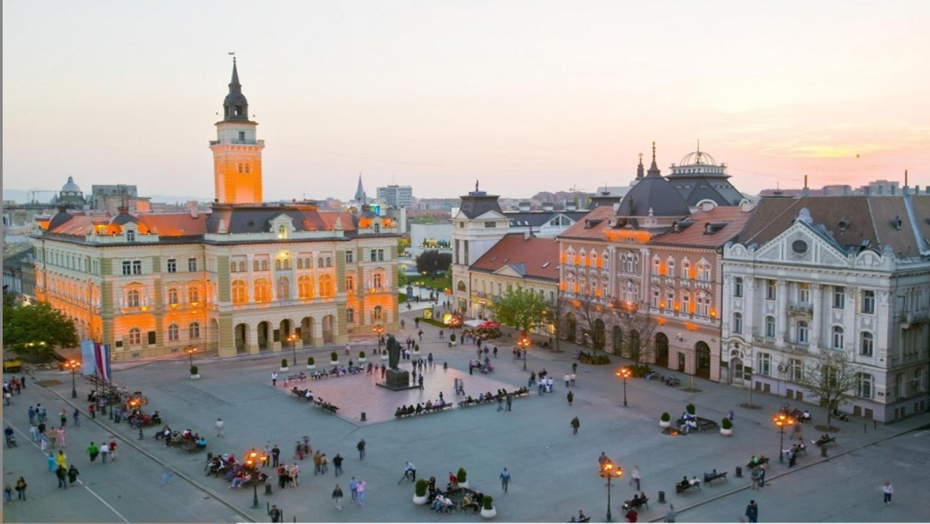
Field trip to Novi Sad