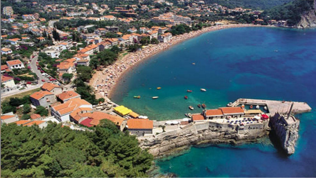
Trip to Montenegro Seaside