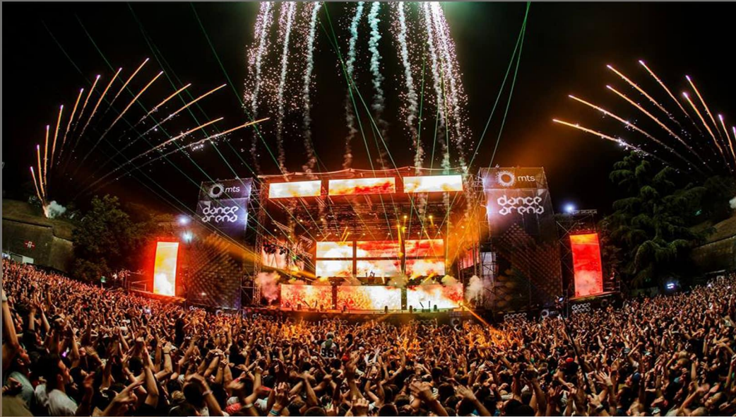
Dance Arena, Exit Festival (Novi Sad)

Here are some more pictures regarding our social programme activities: