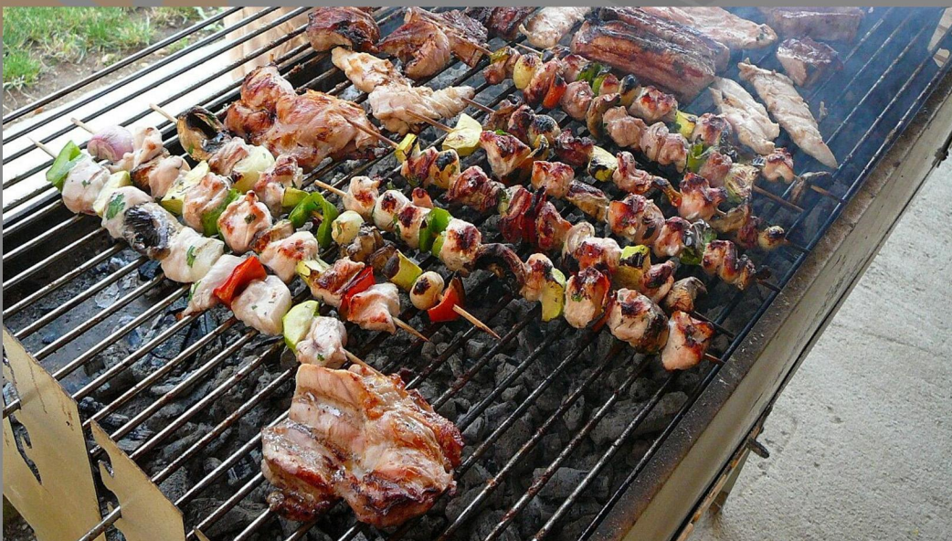
Traditional Serbian BBQ