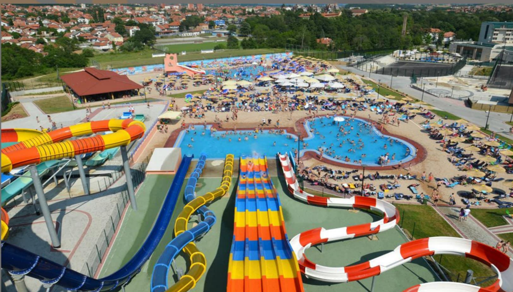
Aqua Park (field trip to Jagodina)